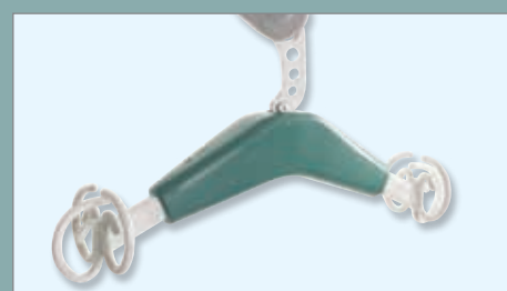
Tri Hook Yoke