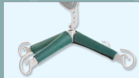
4 Point Yoke