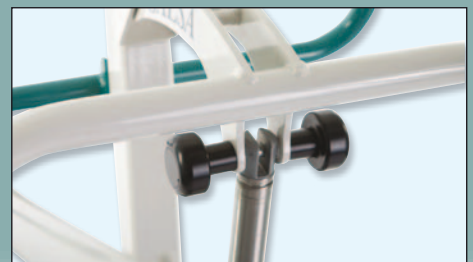
Knob Kit for Custom Sitting Sling