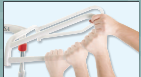
Multiple Grip Positions

With a small footprint and low overall weight, the Salsa 200 is highly maneuverable. A high capacity safe working load of 200kg means the Salsa is equally at home in an institutional or home environment.