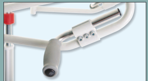
Tempo Handle Kit